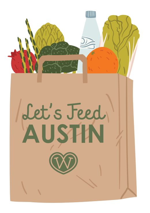
Thanks for helping us feed and care for Austinites in need.

Wheatsville started our 'Let's Feed Austin' (LFA) program during the Fall of 2020 in response to the unprecedented events of the global pandemic and its hard-hitting impact on our community. Many of you turned to us