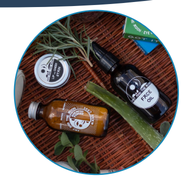
FAT AND THE MOON

Luxurious fair trade handknits made by master knitters in the Andes.