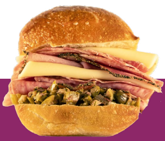
HOT MUFFULETTA SANDWICH