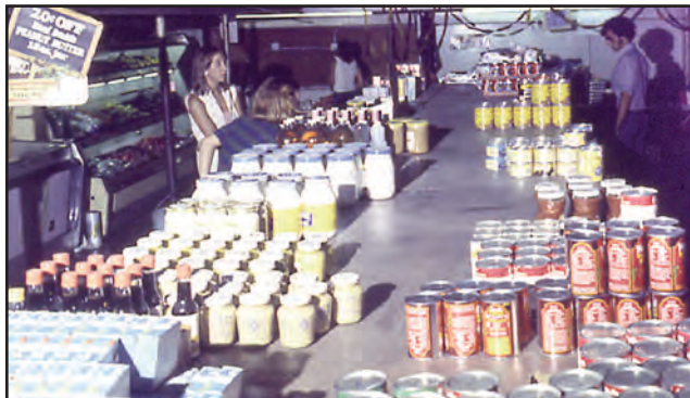
Our humble offering of groceries in 1976

At the beginning we were here because of our founding owners (some of whom still shop here) and today we're here because of all of you! We are literally nothing without our amazing owners! Thanks and Happy Birthday to US!