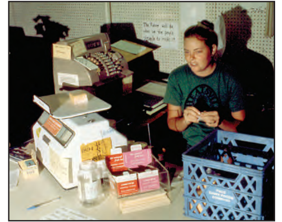
Our check-out in 1976. The sign on the wall reads, "The future will be what the people struggle to make it." The rolling papers are next to the scale.

We grew slowly through some good times and some not so good times and in 2005 we started to again think about what kind of future we wanted for our co-op. Would we finally open that second store people wanted in South Austin since the 80s? Spoiler alert: Yes, we would, but first we had to take care of Home Base. We were bursting at the seams at a facility that hadn't really changed much since we moved in decades earlier and the wear and tear was taking its toll on staff AND shoppers and we weren't reaching all the people we could have if we were just a little more welcoming and open and easy to shop at. Plus it was pretty hard to work here, maybe we could fix that, too. 165 of our owners invested $715,000 and our staff set about planning an expansion and renovation of Guadalupe that was executed in 2008-2009.