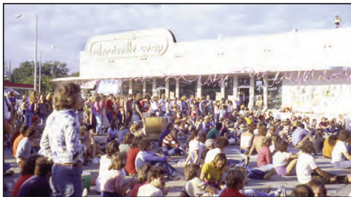
Our Grand Opening Party at 3101 Guadalupe in 1981.