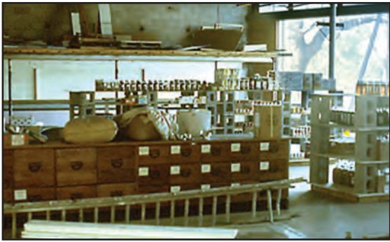
Setting up the original store in March 1976.

Back in the mid-70s our founders had a vision for a cooperative grocery store. A place where they and their friends would get together and get the good food they couldn't get anywhere else at the time. They envisioned a storefront of some kind somewhere near UT, probably, something small and affordable, I imagine. They likely figured we'd sell bulk food for cheap, probably some tofu and produce and maybe a few other odds and ends (ZigZags and wine anyone?). It would be a cooperative owned by its users and it would change Austin and, they dreamed, maybe the world.