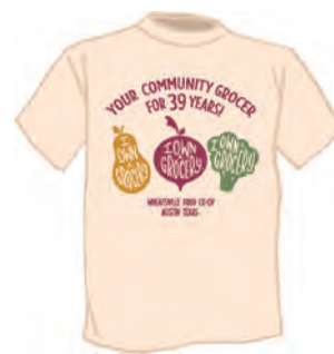
Our limited edition 39th Birthday T-shirt will be available in March.